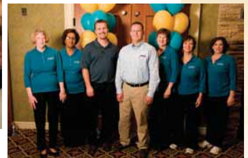
The shirts worn by the APC registration staff were sponsored by Joseph B. Fay Co.