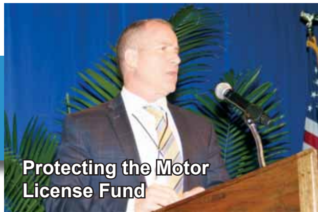
Protecting the Motor License Fund